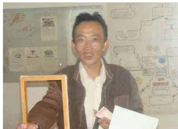
A client visits the Daytop-run Methadone Clinic in Kunming, where former drug users also receive HIV testing and prevention and treatment information.